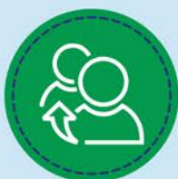
Referrals for clients who need permanent methods