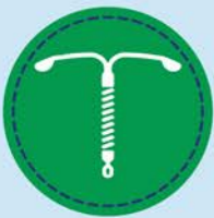
Intrauterine Contraceptive Device

A Mini-COT offers a basket of reproductive health and family planning services which include: