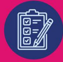
Adherence to Professional Standards

Services provided by competent providers as per Government of India (GoI) and MSI Reproductive Choices clinical standards.