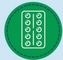
Oral Contraceptive Pills