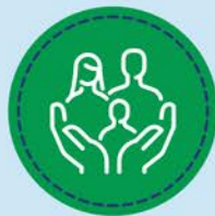
Family Planning Counselling (including postpartum family planning counselling)